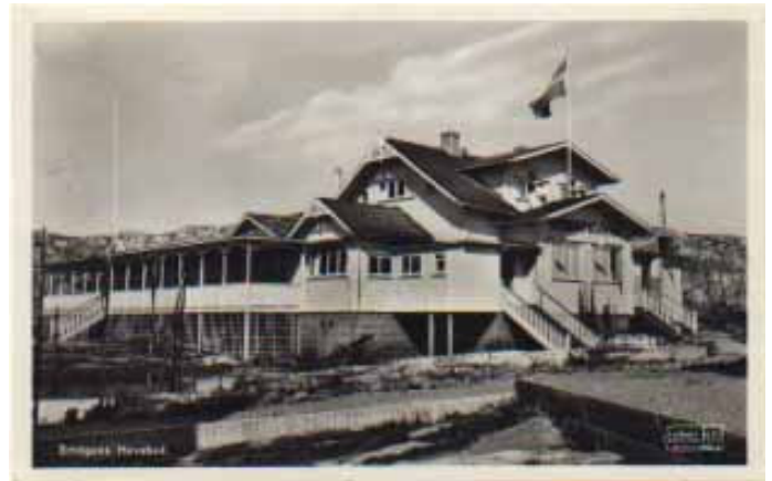
Smögens havsbad in the early days

Smögens Havsbad was inaugurated in 1903 as the first Tourist Hotel of Smögen. During these old days the guests were accommodated in the homes of the more wealthy inhabitants of Smögen as Smögens Havsbad only contained dining rooms and lounges. A separate seaside spa unit was available to the guests where mudbaths and a lot of similar health-promoting treatments were served to the guests. Smögens Havsbad became rapidly very popular, attracting guests from all parts of Sweden and from abroad. One proud moment was when Smögens Havsbad was visited by King Gustavus VI Adolphus in 1955. During the 70ties and 80ties the building suffered from disrepair and the situation became desperate during the early 90ties.